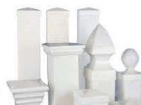
Post & Picket Caps

Now offering the full line of Caps and Accessories from our warehouse in Tennessee.