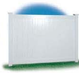
Pre-Fabricated Fence Panels