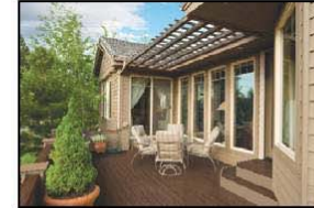
The new Solstice low-maintenance cellular PVC decking line from Deceuninck combines performance with the look of exotic hardwood.

Durable planks are available in dual-color and dual-emboss with a hidden-fastening channel, or as single-color and dual-emboss 5/4" planks. This ultra-low maintenance decking comes in 8 shades with a limited lifetime warranty and 25-year fade and stain coverage.